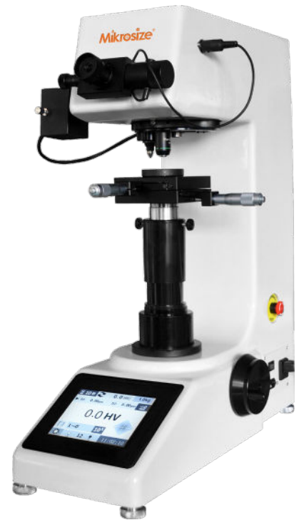
MVicky-10T/50T Touch Screen Macro Vickers Hardness Tester