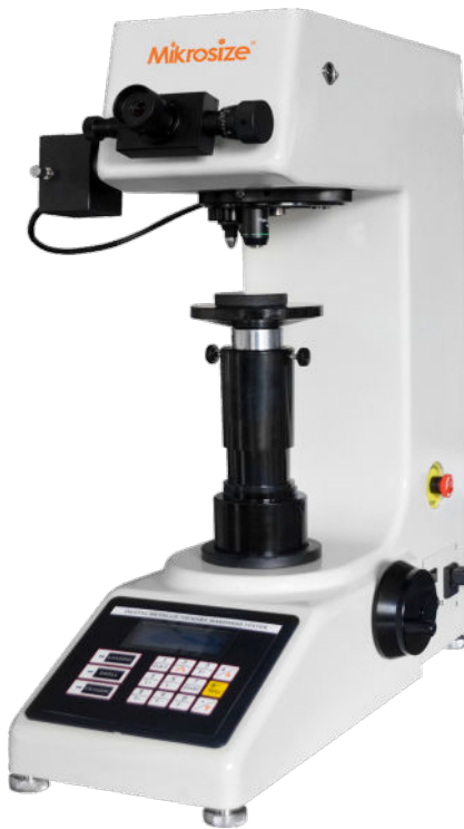
MVicky-10/50 Manual Macro Vickers Hard- ness Tester