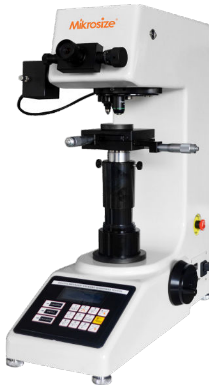
MVicky-10D/50D Manual Macro Vickers Hardness Tester